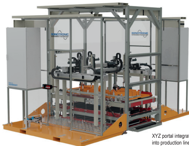
XYZ portal integration into production lines