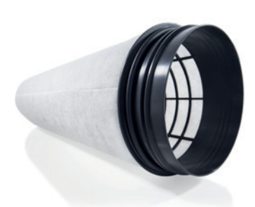
Ultrasonic welding of utility vehicle filters