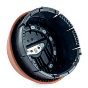
Ultrasonic riveting of aitbag caps

Compared with other welding processes, ultrasonic welding is ideal if rapid process times and good process reliability are demanded. Moreover, ultrasonic welding is characterized by the quality, strength and precise reproducibility of the welds.