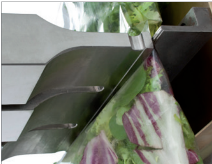
Ultrasonic sealing system for tubular bags

Production faults are drastically reduced with the use of ultrasound, because the contents themselves are not heated. Also, the contents to be found in the seal area are separated by the ultrasonic effect during the sealing process. The quality of the seam produced and the barrier layers of the bag film are not affected.