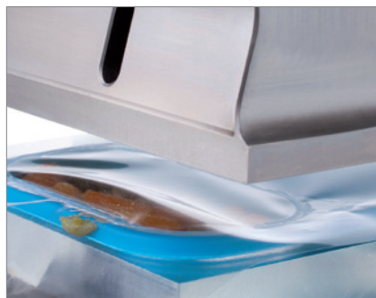
Sealing a tray in contact with product

For format-dependent packaging solutions with ultrasound, we not only adjust the parts nest tools to the packed goods but also the sonotrodes themselves. Depending on the application, sealing and punching tasks are also combined in this case.