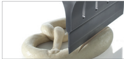
Cutting raw pretzels after brushing with the water-soda solution

Because of the ultrasonic vibrations, cutting sonotrodes work with a lower initial pressure than conventional cutters. At the same time, sonotrode wear is less and the cutting quality is considerably better. In addition, the use of ultrasonic cutting systems has a positive effect on the maintenance and down times of the equipment.