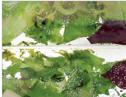
Sealing through contaminated areas