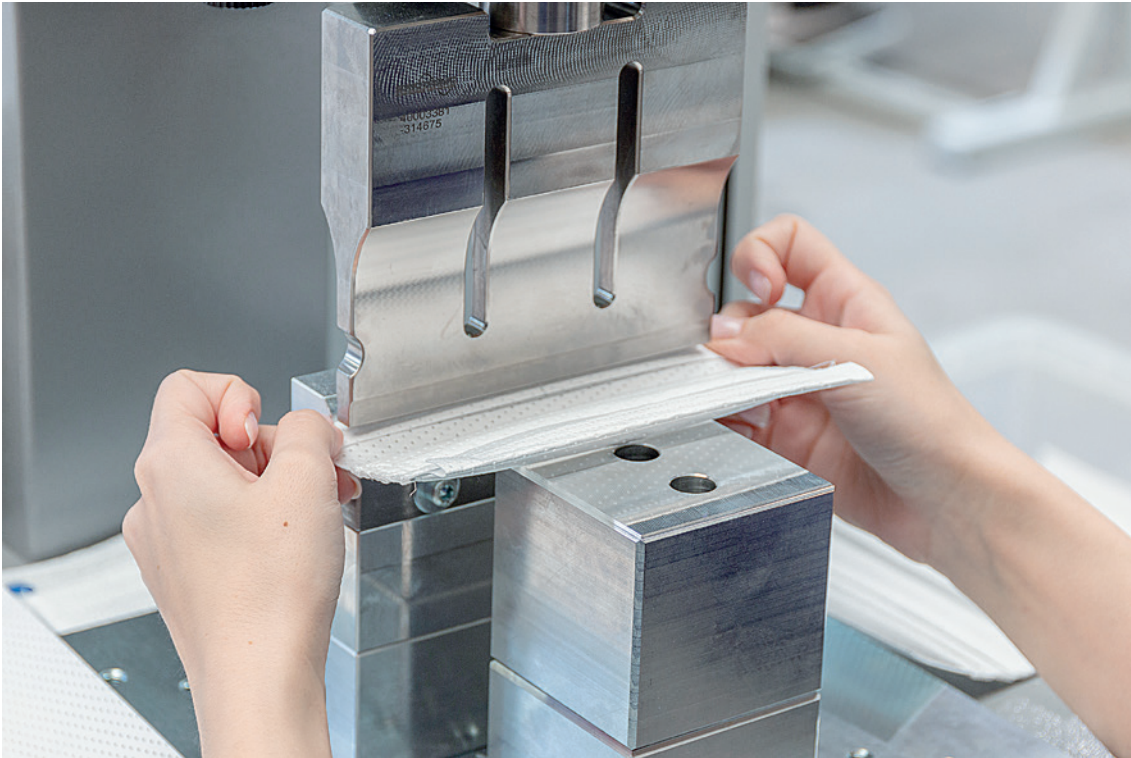
Caption: Ultrasonic welding of the horizontal cross seams of the mask blank for mouth and nose masks