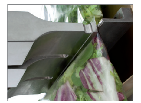
Ultrasonic sealing system for tubular bags

Production faults are drastically reduced with the use of ultrasound, because the contents themselves are not heated. Also, the contents to be found in the seal area are separated by the ultrasonic effect during the sealing process. The quality of the seam produced and the barrier layers of the bag film are not affected.