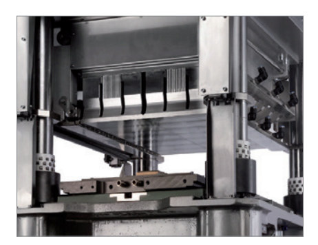
Sonotrode table with flat sealing area

For format-dependent packaging solutions with ultrasound, we not only adjust the parts nest tools to the packed goods but also the sonotrodes themselves. Depending on the application, sealing and punching tasks are also combined in this case.