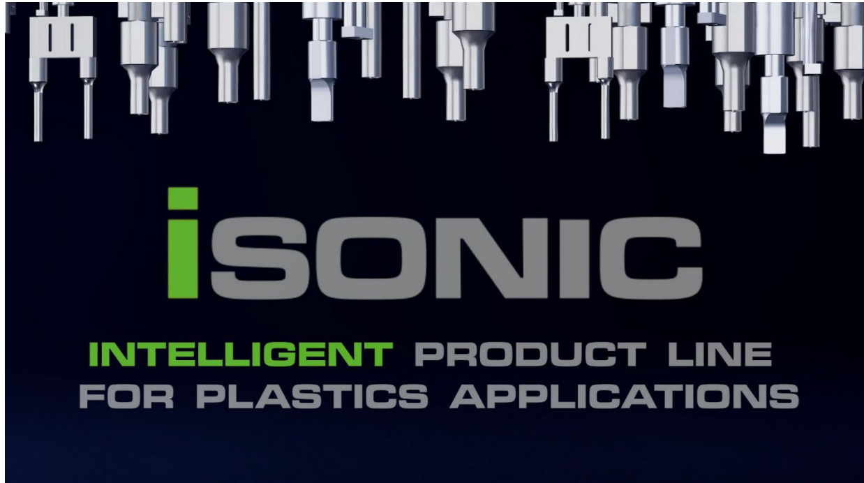
Caption: iSONIC – the product family of SONOTRONIC: Powerful ultrasonic components like iSONIC PULSE and modular assemblies from the iSONIC WAVE series provide flexible and precise solutions for plastic processing.