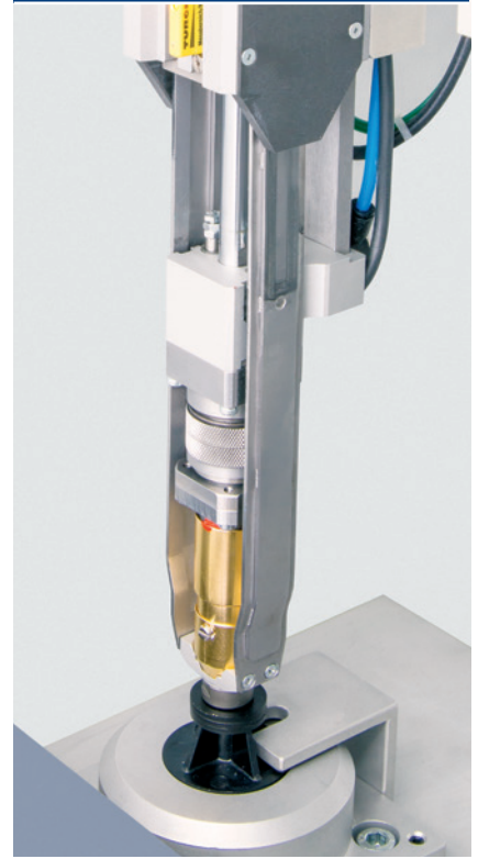
Infrared feed unit with embossing device folded in position moves towards the heated rivet dome for embossing.