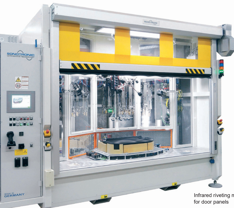
Infrared riveting machine for door panels

With ultrasound and infrared solutions, SONOTRONIC now offers two complementary processes. If required, because of the material properties of the components, the standard and special machines are fitted with infrared units. In addition, total solutions can be achieved by a combination of ultrasonic and infrared feed units (hybrid machines). A classic example of this is loudspeaker grilles made from POM, which are to be fitted into door panels together with other parts. The innovative infrared riveting process is already used in the market in many cases in customised machines. Both hybrid machines with ultrasound and infrared, as well as special machines have been produced, with more than 50 infrared feed units in each case.