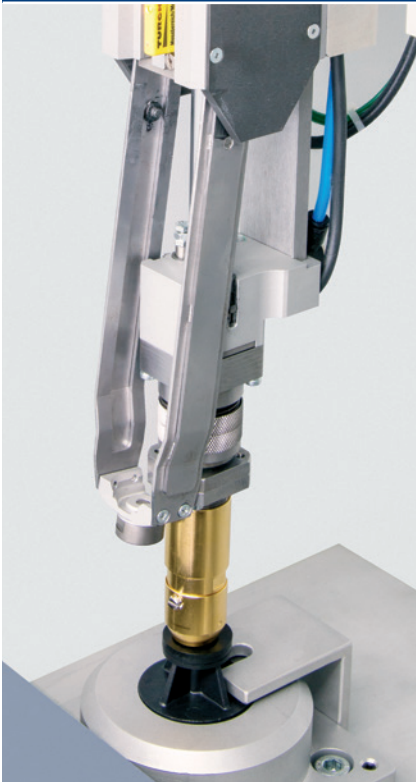
Infrared feed unit with extended emitter emits focused radiation into the rivet dome.