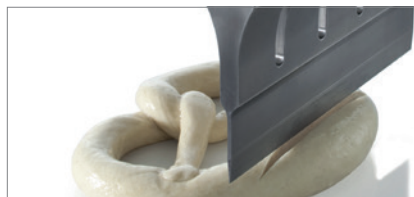
Cutting raw pretzels after brushing with the water-soda solution

Because of the ultrasonic vibrations, cutting sonotrodes work with a lower initial pressure than conventional cutters. At the same time, sonotrode wear is less and the cutting quality is considerably better. In addition, the use of ultrasonic cutting systems has a positive effect on the maintenance and down times of the equipment.